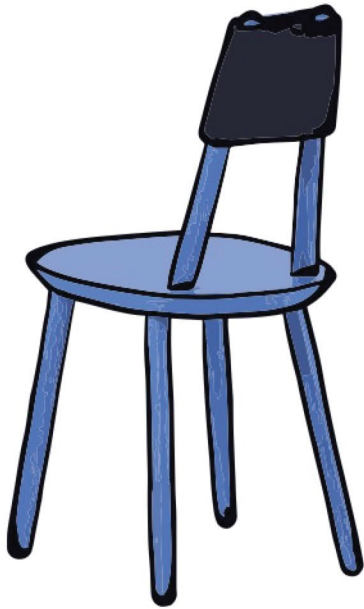
Naïve chair design by etc.etc.